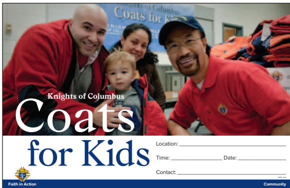
Promotional Poster – Horizontal (#10587)

The Supreme Council offers the below items for order through Supplies Online, the supply ordering portal available on Officers Online.