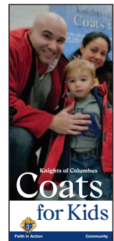
Coats for Kids Trifold (#10503)